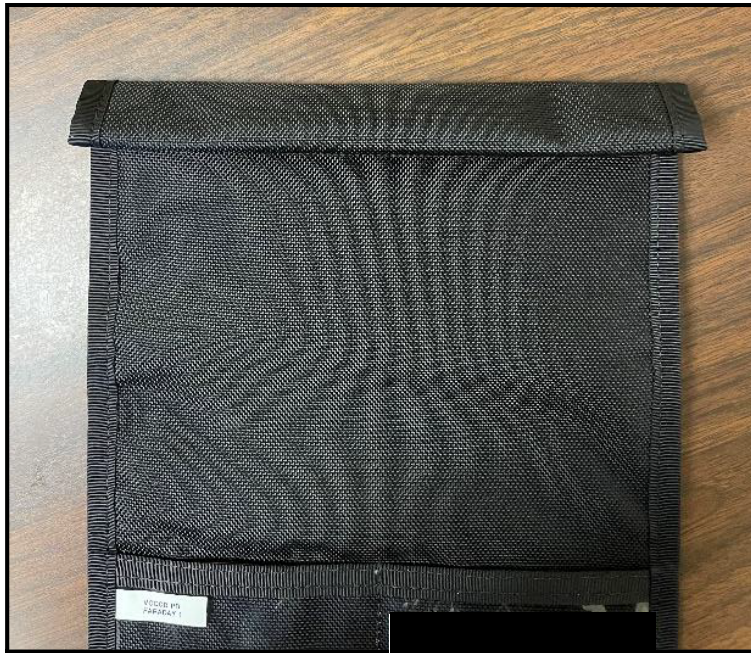
Figure 2 Closed faraday bag

Training Bulletin composed by: CSO Andrew Bumblis